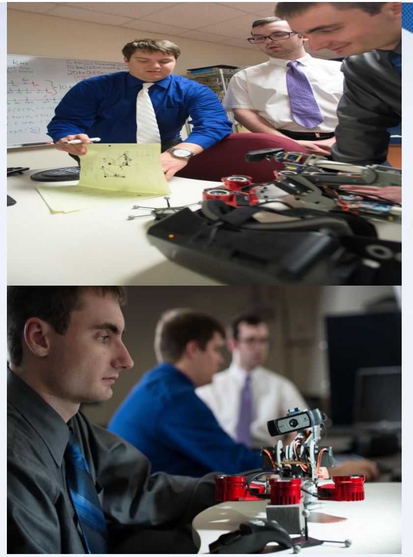
CLIG: Mentoring leaders for Excellence